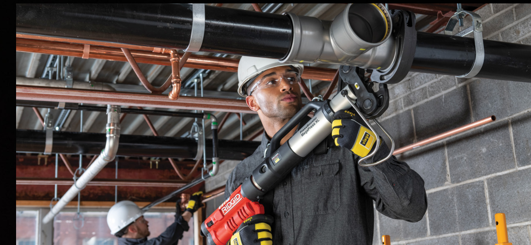
Secure, flameless connections on gas lines