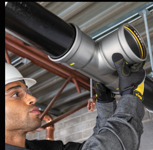
Available ½" to 4"