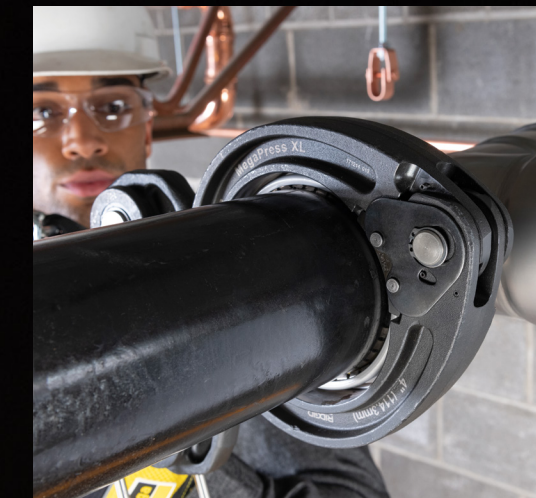
Connections take 16 seconds or less